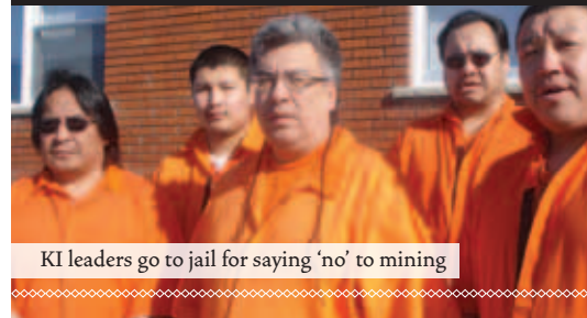
KI leaders go to jail for saying 'no' to mining