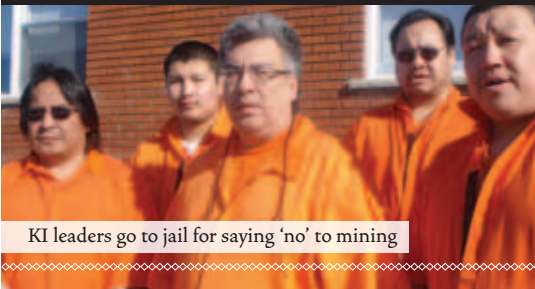
KI leaders go to jail for saying 'no' to mining